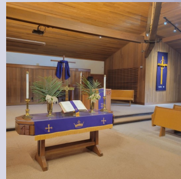
Our beautiful sanctuary—Palm Sunday

April 28, 2024 , The Fifth Sunday of Easter Acts 8:26-40 “How Can I Understand?”